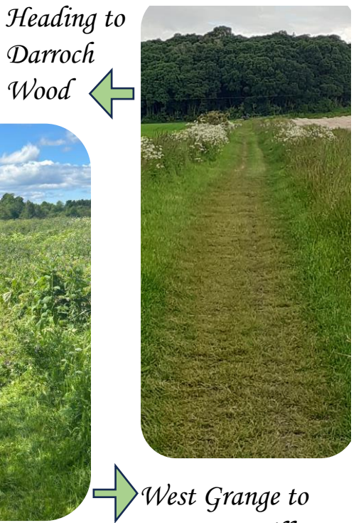
West Grange to East Mill